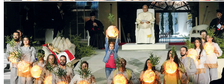
Pope Leo XIV watches a performance by youth holding illuminated globes during an event in Bkerki, the seat of the Maronite Church, in Lebanon December 1, 2025.