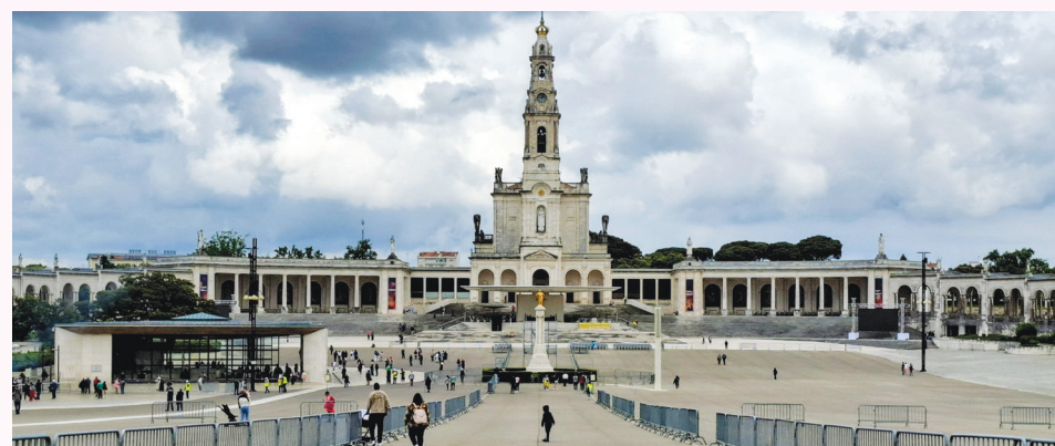
Basilica of Our Lady of the Rosary of Fatima in the large grounds of the Shrine of Fatima.

Fatima town has been designed and developed for the many pilgrims who visit the shrine daily and even more during the annual Feast of Our Lady of Fatima in May. There are various types of accommodation, restaurants,