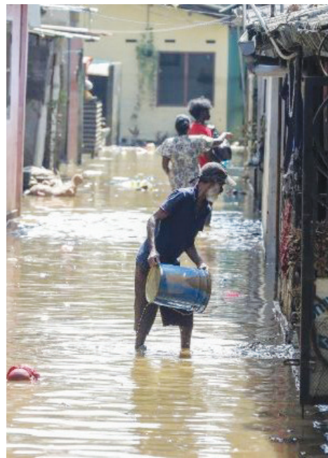
Sri Lankan flood-affected people clean their mud- and water-covered home in a flood-affected village in a suburb of Colombo, Sri Lanka.