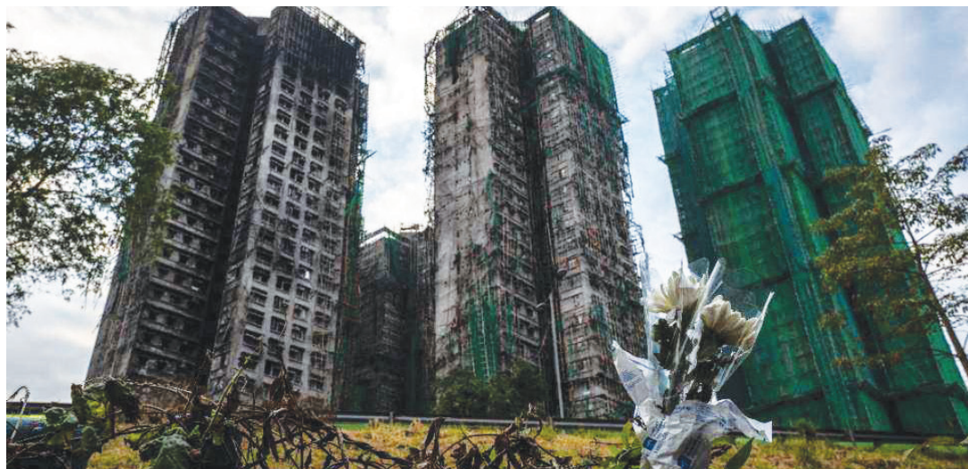
Flowers are seen in front of the Wang Fuk Court apartment blocks in the aftermath of the deadly Nov 26 fire in Hong Kong's Tai Po district on Dec 3, 2025.

HONG KONG: The death toll from Hong Kong's worst fire in decades rose to 159 after all affected housing blocks were searched, police said on December 3, cautioning that the figure may not be final.