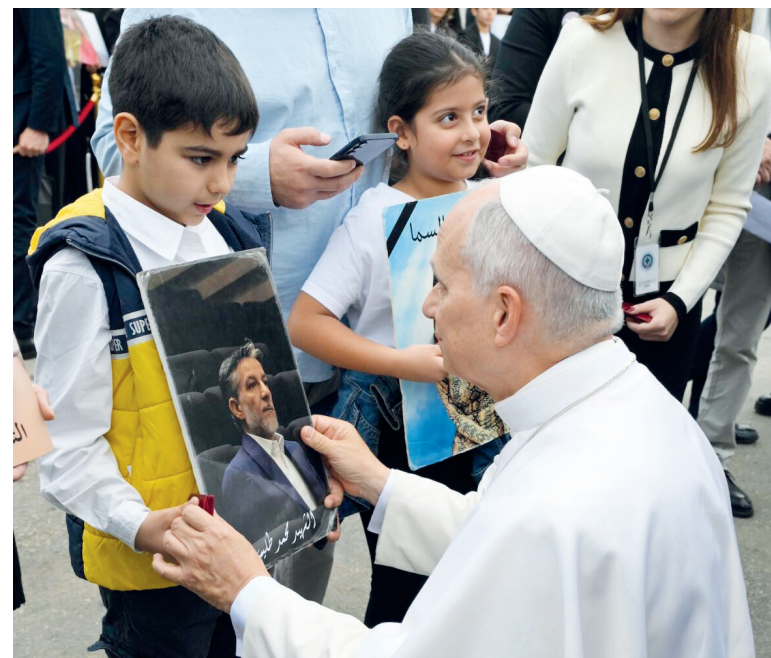
Pope Leo XIV kneels to speak to a boy holding a photo of a loved one lost in the deadly explosion in 2020 at the port in Beirut December 2, 2025.