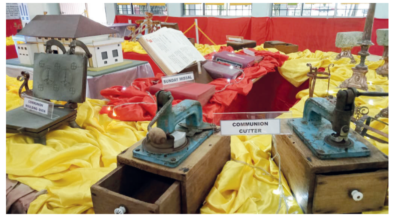
Exhibition of the historical items.