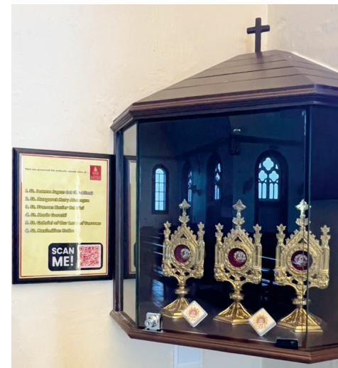
The plaque next to the relics.