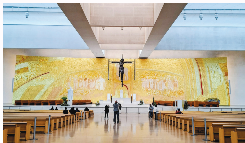
Basilica of the Holy Trinity has a seating capacity of close to 9,000 people.