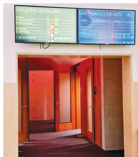
Reconciliation rooms where priests listen to confessions in different languages.