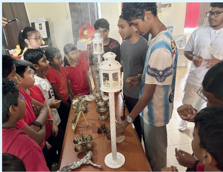
A server explaining about some of the sacred vessels used at Mass.

Visitors were first welcomed with a compilation video high-