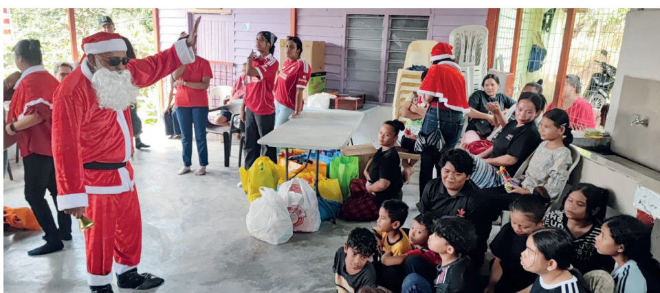
The lawyers entertaining the Orang Asli children.

Everyone was delighted to share the hope, peace and joy with the Orang Asli community in Kg Belihoi.