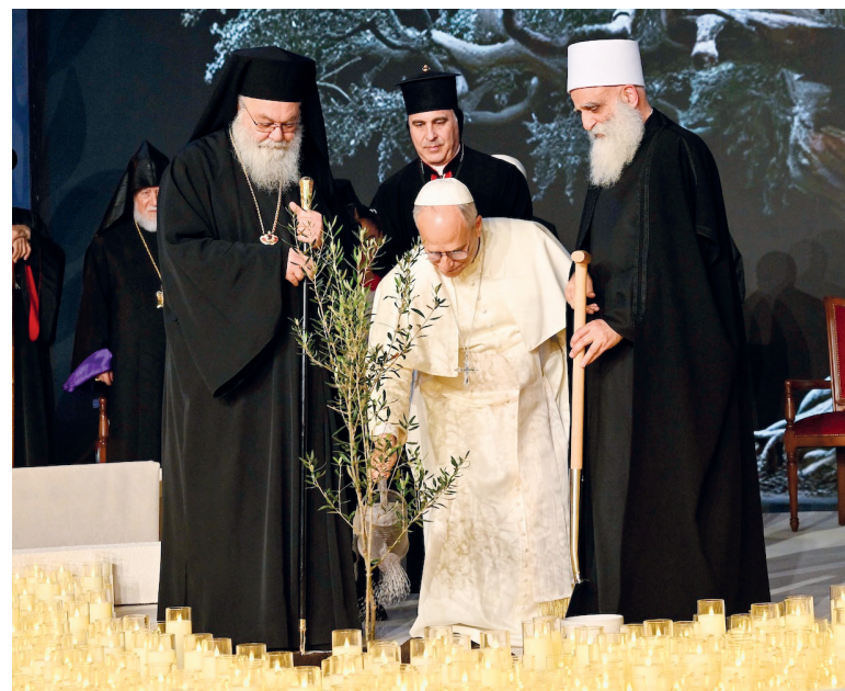
Pope Leo XIV waters an olive tree after he and other religious leaders planted it during an ecumenical and interreligious meeting in a tent at Martyrs’ Square in Beirut December 1, 2025.

They carried photos of the loved ones they lost and signs appealing for the government to seriously investigate who was at fault for