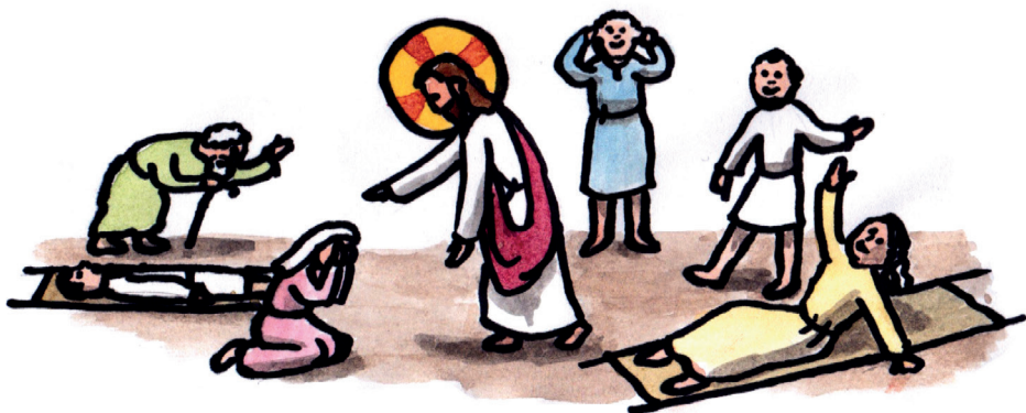
Answer: The blind receive their sight and the lame walk, lepers are cleansed and the deaf hear, and the dead are raised up, and the poor have good news preached to them.