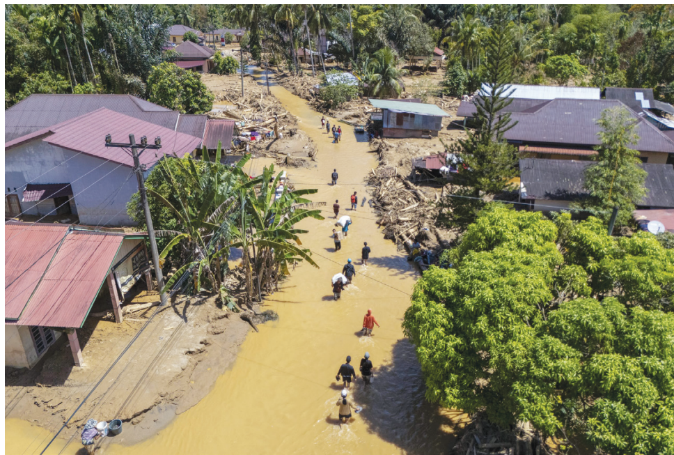
This picture shows an aerial view of villagers wading through the mudflow to find a shelter in the aftermath of flash floods in Tukka village, Central Tapanuli, North Sumatra province, on December 3, 2025.

The remaining 17 per cent funds additional activities such as ecclesial life, historic assets, and academic institutions. Vatican News