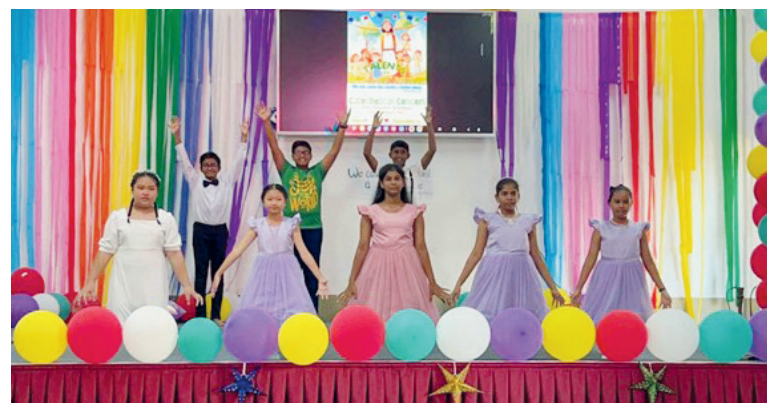
Performances by the catechism students.

extends heartfelt gratitude to Fr Stanley, catechists, parents, volunteers, and all students for their dedication, effort, and participation. With such support