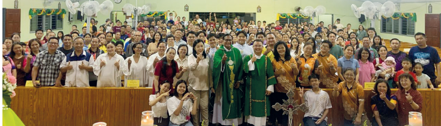
Celebrating mass with the parishioners of Gereja Roh Kudus in Sook, Keningau in March 2025.

ury, something essential was missing. There was no deep sense of fulfillment — no “yes, this is it.” That moment finally arrived unexpectedly while I was stationed in Myanmar.